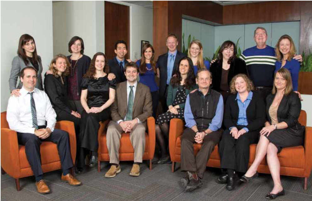
Members of the 2013-14 Edmond J. Safra Research Lab

plishment this year was the completion of a two-year consultation and development process with Fellows and Faculty to construct a thematic division that works across multiple dimensions to structure and connect all the Lab's research projects. While institutional corruption had become a mature and independent field of study by the end of our third year, in the fourth we started to establish subfields of institutional corruption in government and law, in public health, academia and non-profits, economics, and in psychology.