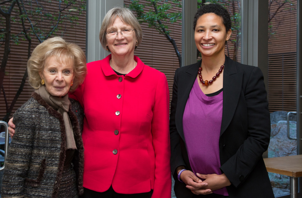
Lily Safra, Drew Faust, and Danielle Allen