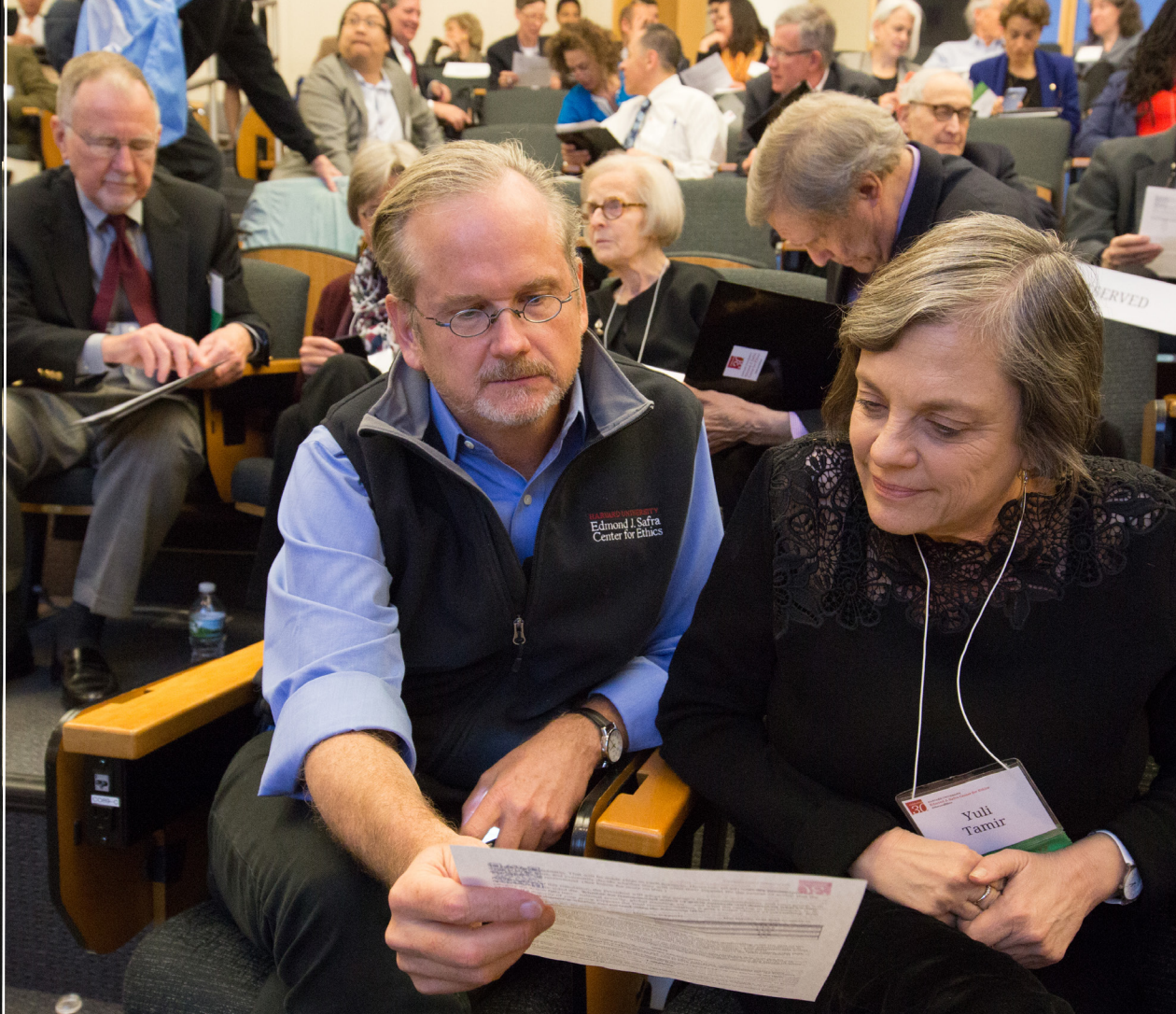
Larry Lessig and Yuli Tamir