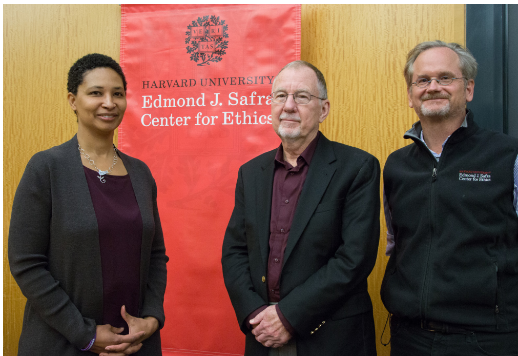
Danielle Allen, Dennis Thompson, and Larry Lessig